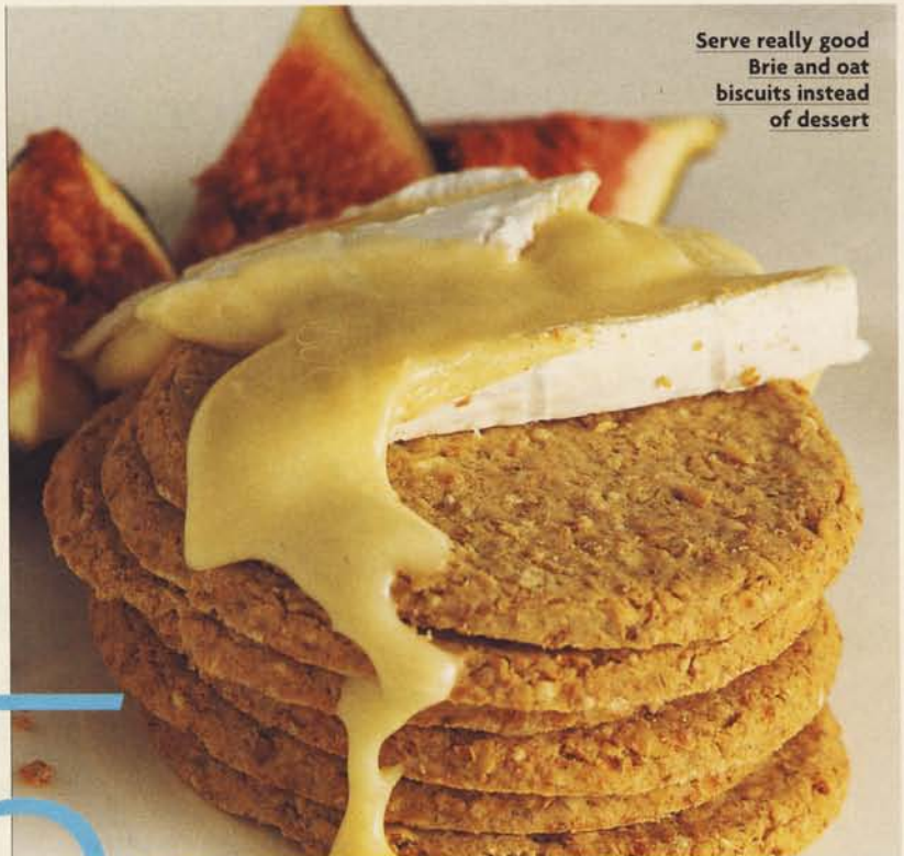
Serve really good Brie and oat biscuits instead of dessert