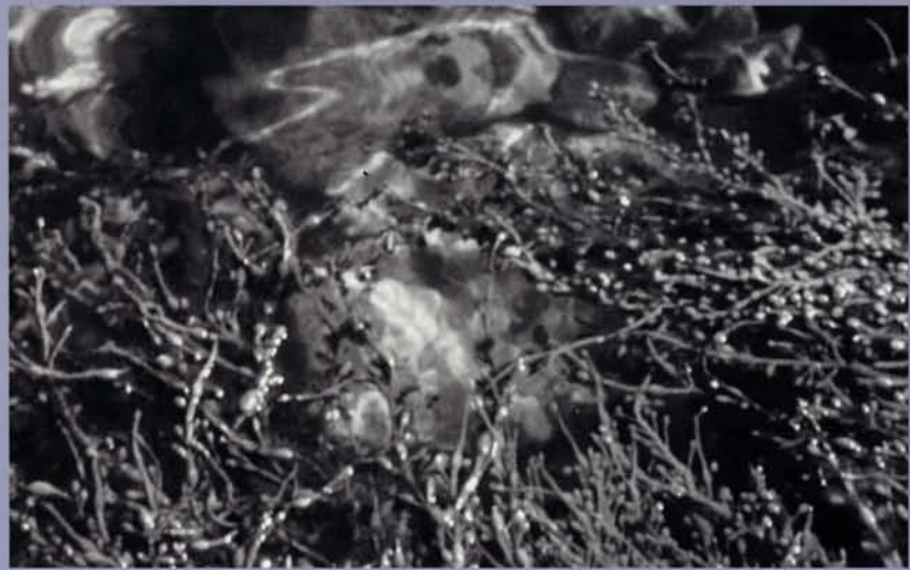
Close up of seaweed in the Lofoten Islands

The therapeutic use of heparin has produced clinical remission in the majority of patients with inflammatory bowel disorder and special polysaccharides in the wrack seaweeds have been shown to share many of the properties and modes of action of heparin. One of the mechanisms involved is the restoration of the fibroblast growth factor activity that stimulates repair of the epithelium. Another is their mucosal protective properties.