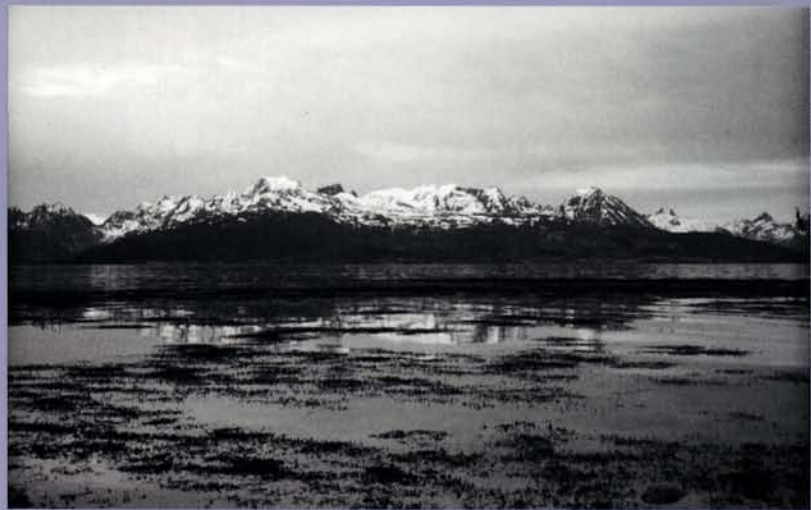
Landscape of the Lofoten Islands

Wrack seaweed is the finest natural source of stable, fully chelated iodine (bound to protein) and in Seagreens® Food Capsules a unique blend of Arctic wrack varieties has been used to provide an optimum nutritional profile without the excessive